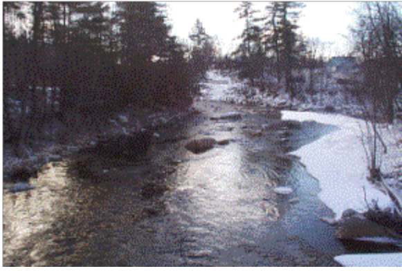
Figure 5-3. Swift River